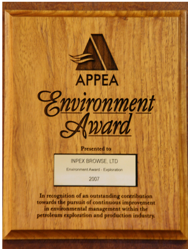
APPEA Environment Award