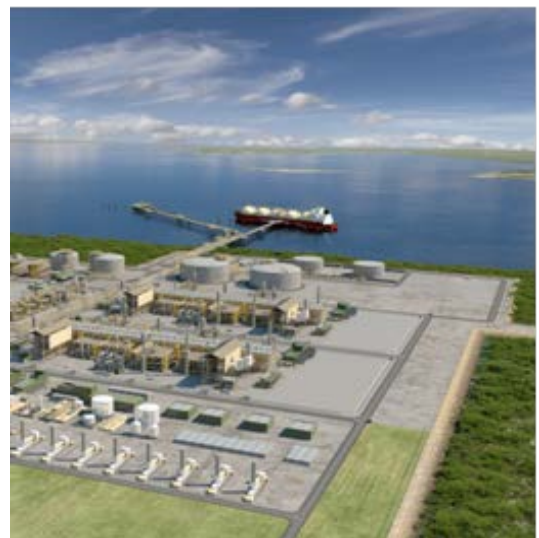
Ichthys LNG Plant, Darwin (rendition)