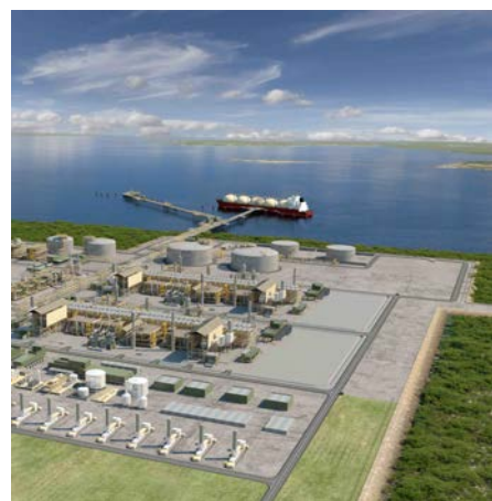
Ichthys LNG Plant, Darwin (image)