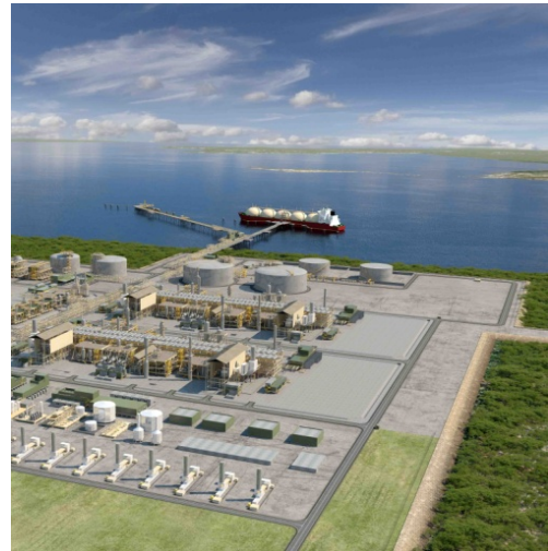
Ichthys LNG Plant, Darwin (image)