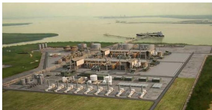
Ichthys LNG Plant, Darwin (image)