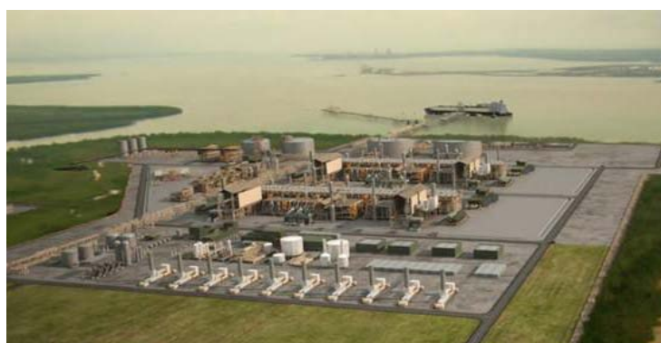
Ichthys LNG Plant, Darwin (image)