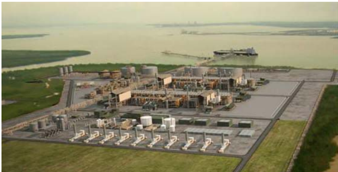
LNG Plant Layout