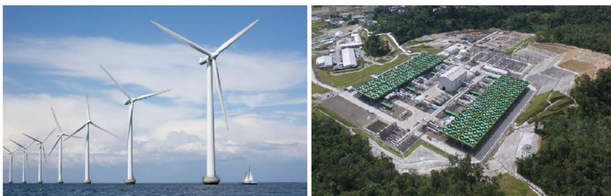
Images of wind and geothermal power generation business